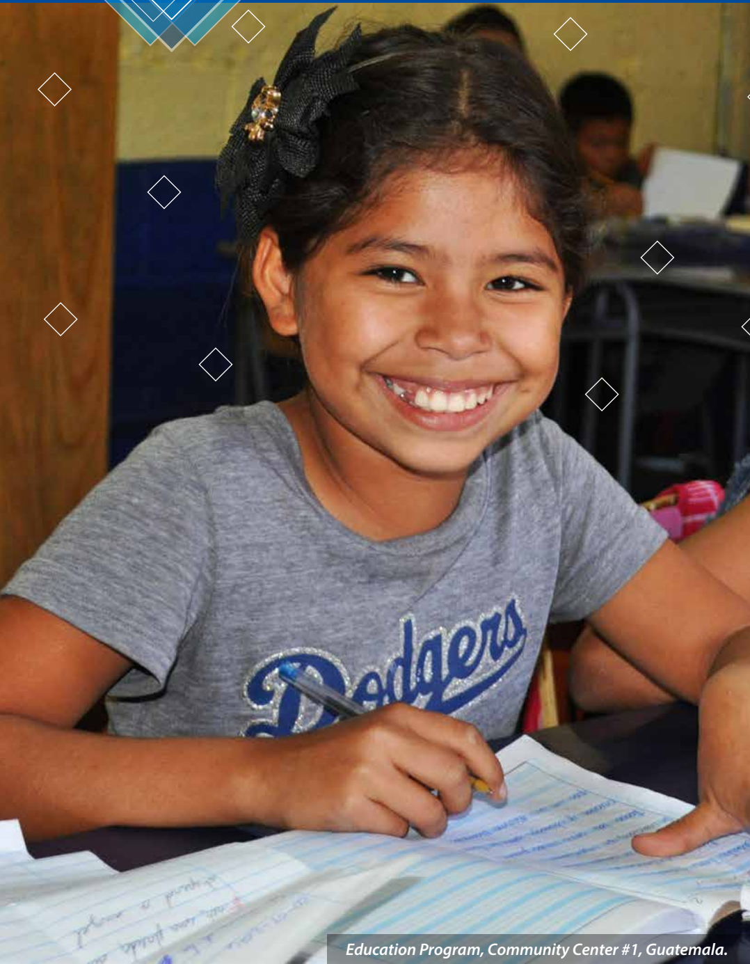
Education Program, Community Center #1, Guatemala.