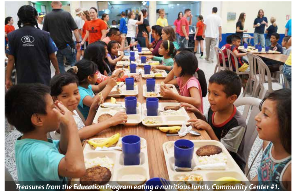
Treasures from the Education Program eating a nutritious lunch, Community Center #1.