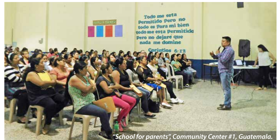
"School for parents", Community Center #1, Guatemala.